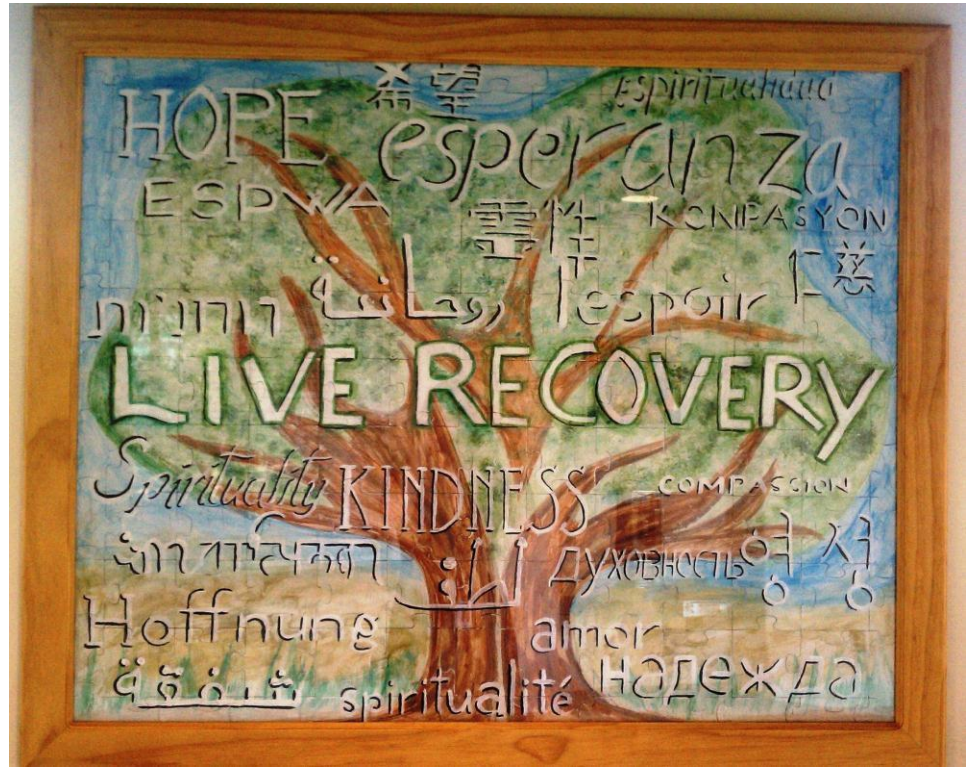
Wall Hanging outside of Park Place Café