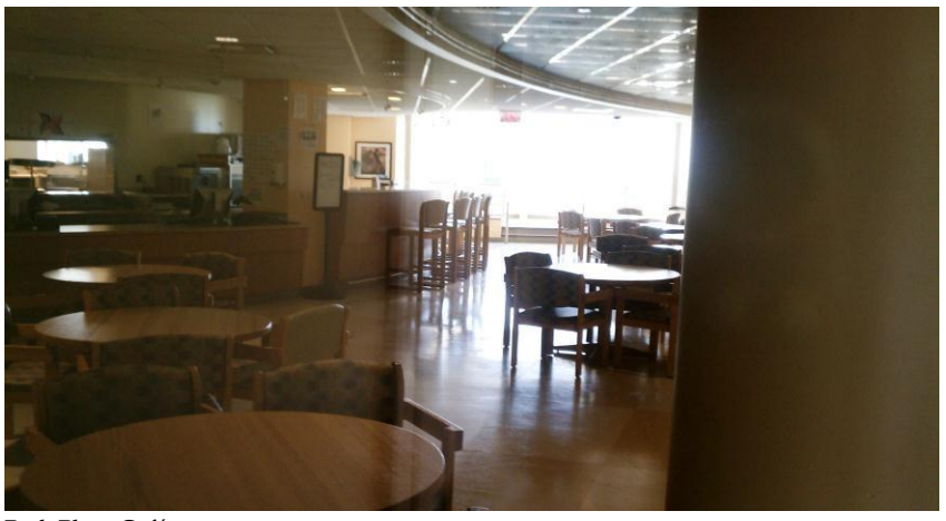
Park Place Café

In July 2008, GPPH moved into a new, state-of-the-art building. Interns will be given swipe cards to access the building entrances and access to the units. Physical keys will be assigned depending on the units to which interns are assigned. Ample parking is available in the parking lot adjacent to the hospital. Interns will be assigned to cubicles with lockable cabinets, personal computers, and telephone lines. Each intern will be given an email and voicemail accounts. Interns also have access to office supplies, the IT department help desk, and the department's clerical support staff for help with any administrative tasks. Within the hospital, there are conference and consultation rooms that interns will be able to utilize for therapy and testing. On each unit are a pair of consultation rooms with a one-way mirror that is used for therapy and testing supervision as needed. In addition to the onsite library, interns will have access to PsycINFO and several other online databases. Most resources, if not available online or in the library, may be accessed easily through interlibrary loan by making a request to the hospital's librarian.