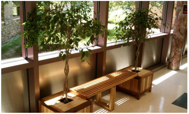
Bench outside of J-Wing

are expected to present assessment findings to both the referred patient and the referring treatment team in order to promote the patient's recovery.