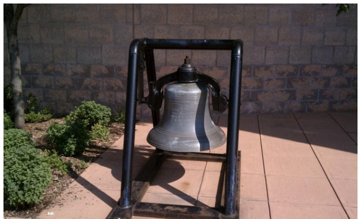
Bell from Old Main Building

The GPPH Psychology Internship Program complies with New Jersey law prohibiting employment discrimination based on an individual's age, sex (including pregnancy), race, creed, color, religion, ancestry, nationality, national origin, familial status, genetic information, marital/civil union status, domestic partnership status, affectional or sexual orientation, gender identity and expression, atypical hereditary cellular or blood trait, liability for military service, and mental or physical disability (including perceived disability and AIDS and HIV status).